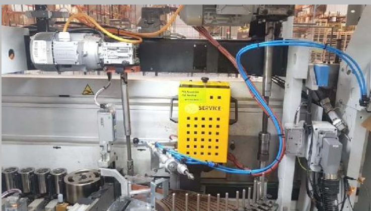
Biesse – after 10 months in use