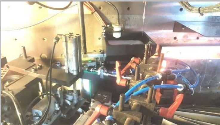
IMA with open pre-melter